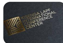
KISENGA INTERNATIONAL CONFERENCE CENTER